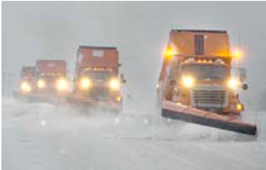
Dakota County snowplows