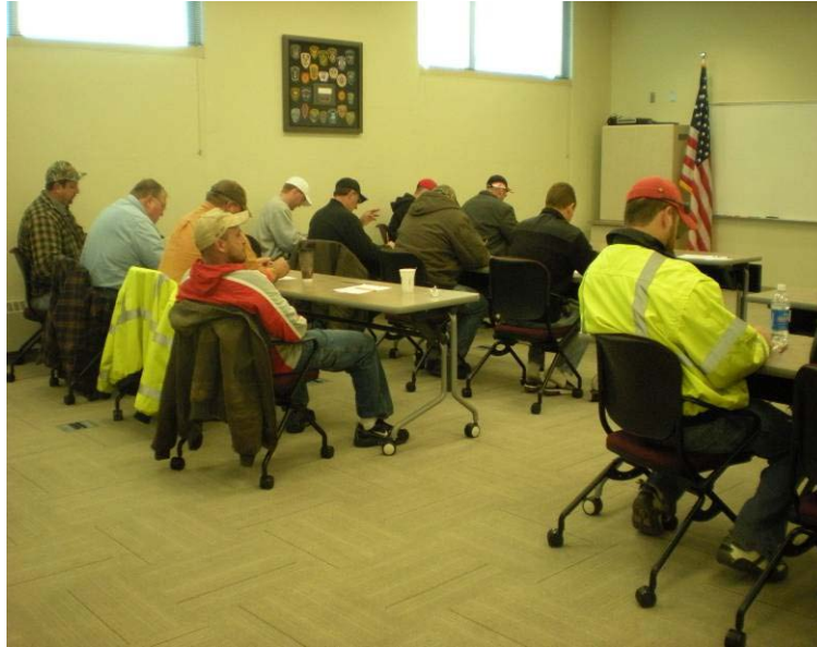
Taking the second-round KAP study, September 2010.